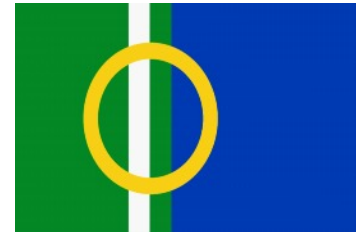
Examples of village flags registered with the Flag Institute